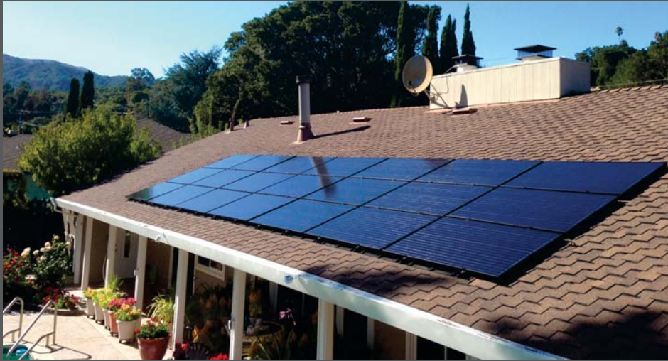
SUNMIZER FOR COMPOSITE SHINGLE ROOFING

Attractive, Tested, Certified and AFFORDABLE: Roof integrated SunMizer Solar Roofing Systems are a cost competitive, affordable way to integrate solar into the building envelope as a standard or optional feature in new home design. Systems start at around $7,000 (after federal incentives) for a basic 8 panel system. The SunMizer roofing component replaces an area of roofing material equal to the system footprint. Any cost differential between SunMizer and traditional solar mounted over the existing roof, is generally offset by this replacement.