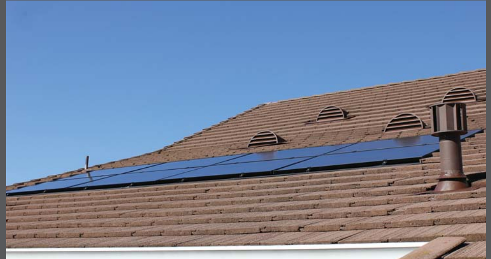
SUNMIZER FOR CLAY OR CONCRETE TILE ROOFING

Sleek, Low Profile SunMizer is a Complement To Any Roof