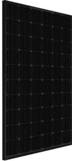
300 Watt Monocrystalline Solar Module

Black framed solar modules with black backsheet combined with SunMizer's low profile design provide a "skylight" aesthetic that complements any roof.